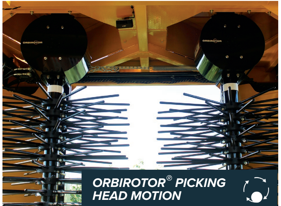
ORBIROTOR® PICKING HEAD MOTION

Pioneered by Oxbo and available on every model, the multi-crop Orbirotor picking system uses an orbital shaking pattern and 5/8-inch acetyl rods. This picking system is easily adjustable to meet a wide range of picking requirements. As a free floating head, the Orbirotor moves with the plant and delivers a selective picking action —shaking off the ripe fruit and leaving the unripe fruit undamaged for the next pick. The Orbirotor is the most selective head on the market!