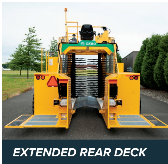
EXTENDED REAR DECK