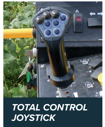
TOTAL CONTROL JOYSTICK